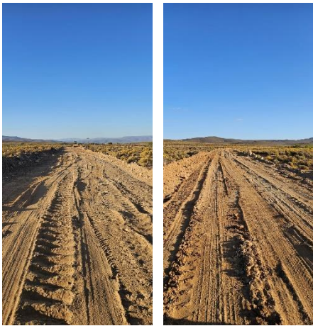
Road construction underway.