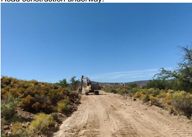
Road construction underway.