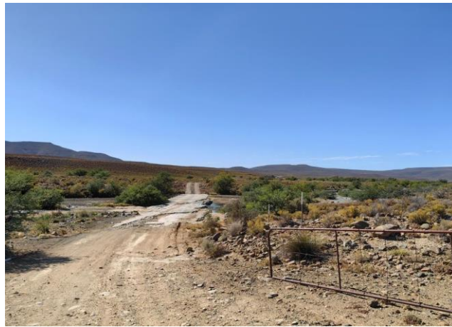
Concrete causeway to be constructed in water course.