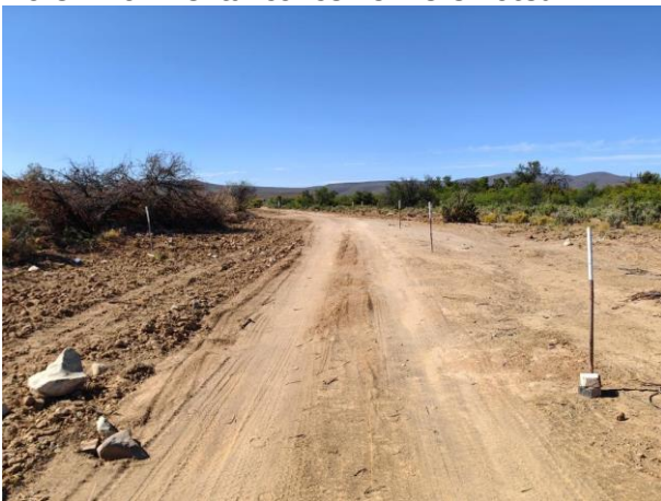
Road construction underway.