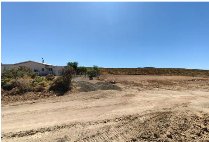
Offsite office and accommodation.

It is noted that an office area and accommodation, with a small, cleared area for containers has been established near the start of the access road. The area is outside of the WEF development footprint and on an existing farm property. An existing house is being used and a small area has been cleared on previously disturbed land, alongside the house. The septic tank is to be replaced with a large conservancy tank to allow for the additional people on the site.